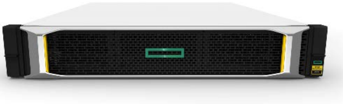
HPE MSA 2052 SAN Storage